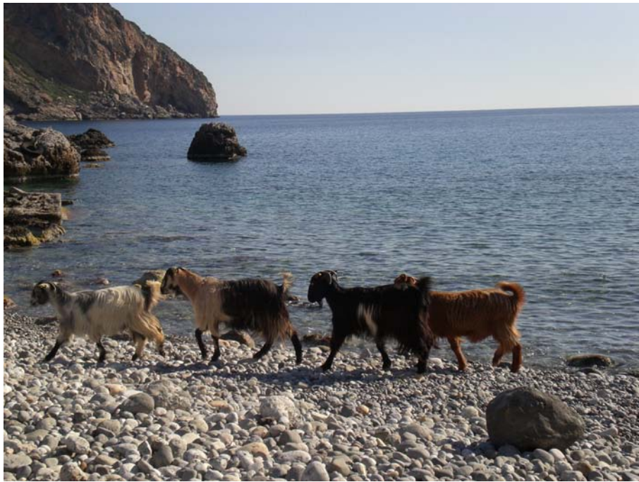
Goats on the beach at Lisos.