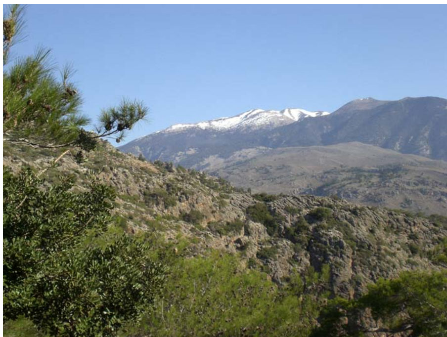
Snow on the high mountains near Soughia.

Late November I took off for 10 days of gorge walking in the Paleochora and Soughia areas. Great weather and I didn't see another tourist the who time. For those of you not on Facebook here is a little peek: